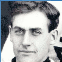
many of his fondest childhood memories.

more school-age children and double our capacity of preschool children in our five-star, quality-rated program. We are so thankful to The Dayton Foundation for this grant that allows us to serve more children.”